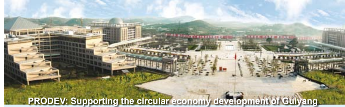
PRODEV: Supporting the circular economy development of Guiyang