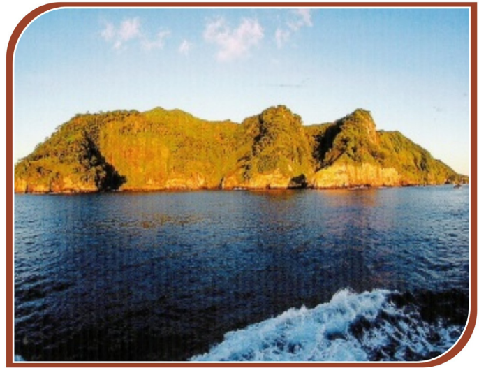
Cocos Island National Park Costa Rica, the only island in the tropical eastern Pacific with a tropical rainforest, was inscribed on the World Heritage List in 1997