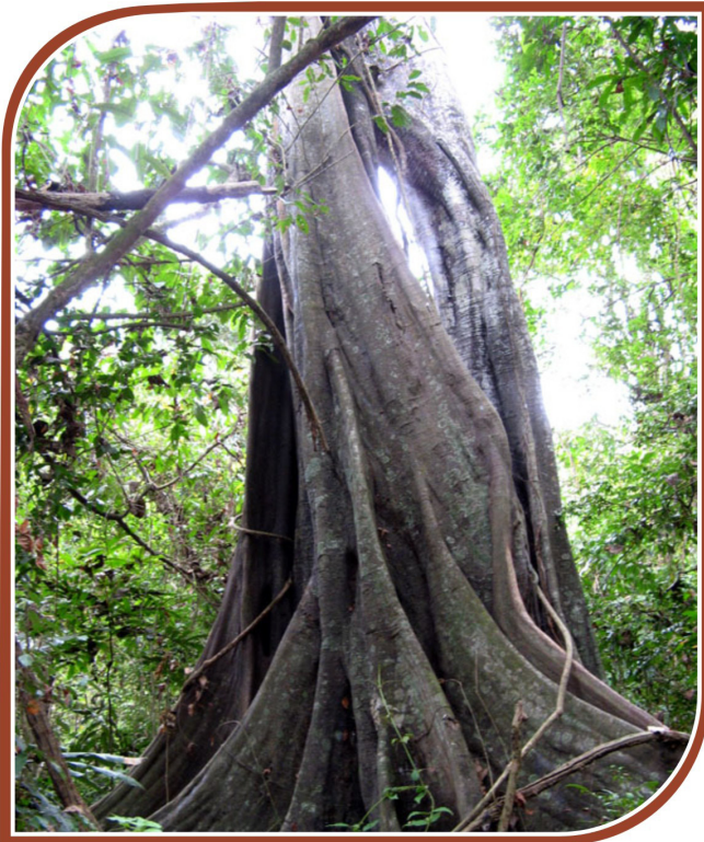
Sustainable tourism in the Central American natural and cultural heritage sites aims to preserve areas rich in biodiversity...