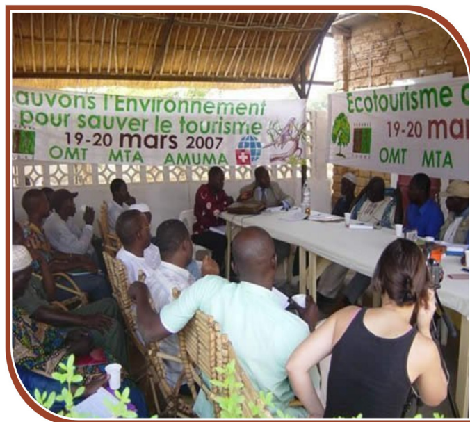
A workshop on eco-tourism conducted within the framework of a ST-EP project in Mali