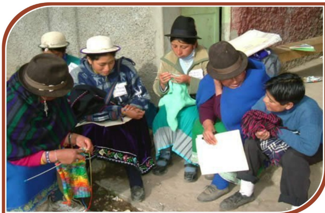
Micro-tourism entrepreneurs during one of the training sessions of the project in Ecuador